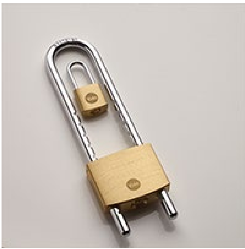
Exclusive Yale design

Even those DIY tools in your shed can be kept safe and secure, with a hardened steel shackle and double locking for added security, built with you in mind.