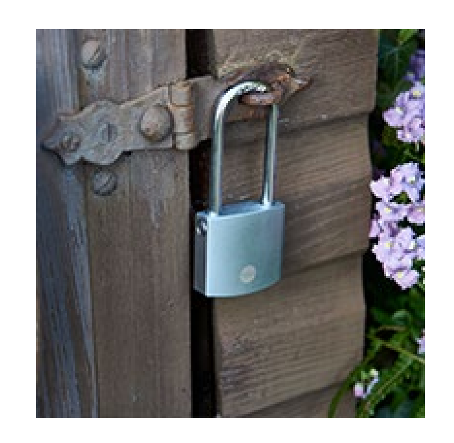
Designed for outdoor usage

With 180 years of manufacturing expertise, we are introducing our padlocks with an exclusive Yale design and tested to EN12320:2012 standard for added security and reassurance, built with you in mind.