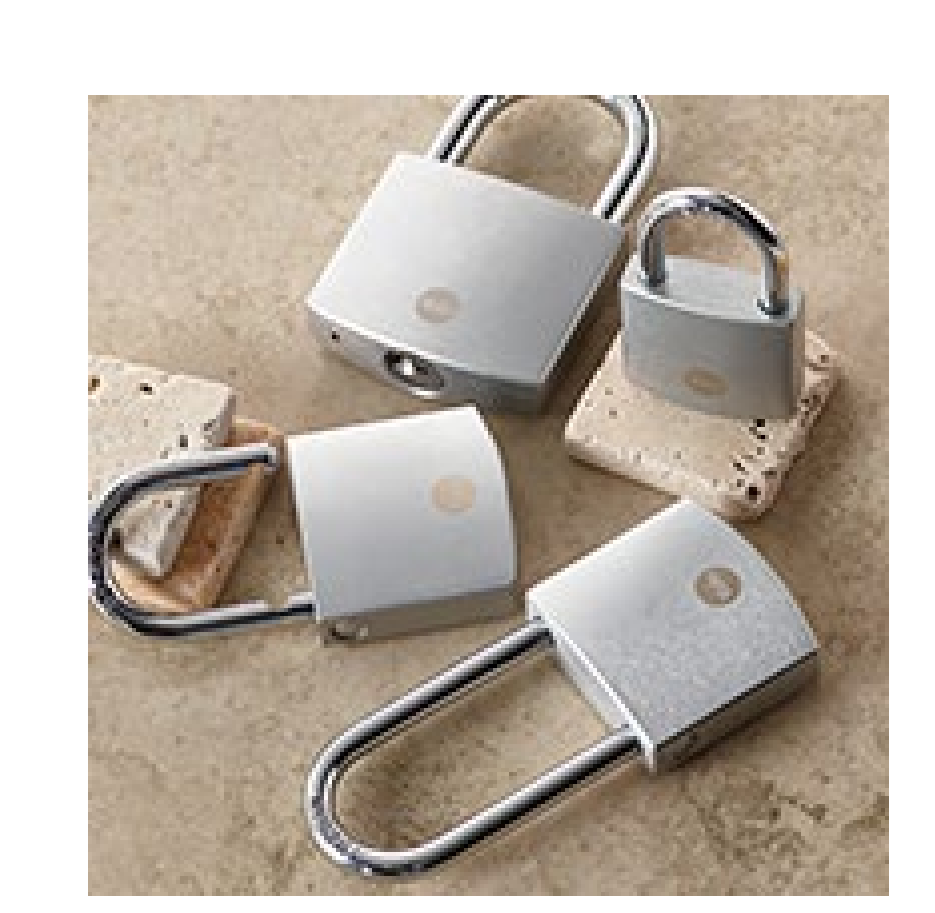
Exclusive Yale design

Even that special bike can be kept safe and secure in your garage with a Boron shackle to prevent cutting and double locking for added security, built with you in mind.