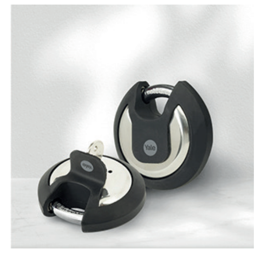
Exclusive Yale design

With a hardened steel shackle to prevent cutting, key retaining and double locking for added security, you can be assured that your home or business is safe and secure. To ensure optimum performance it's important to lubricate the lock regularly.