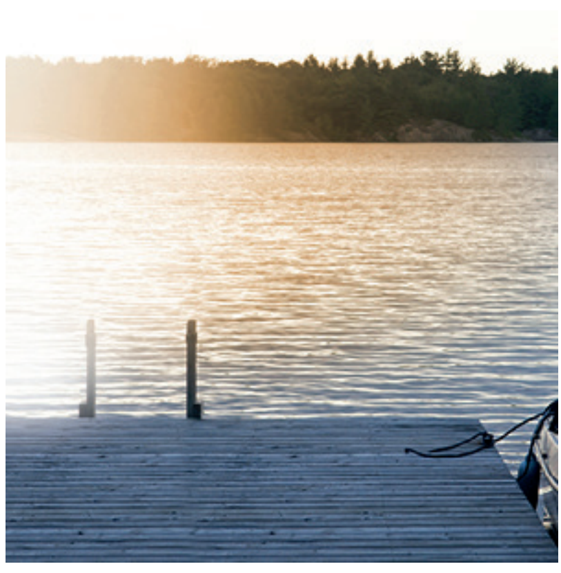
Designed for extreme outdoor usage

With 180 years of manufacturing expertise, we are introducing our padlocks with an exclusive Yale design and tested to EN12320:2012 standard for added security and reassurance, built with you in mind.