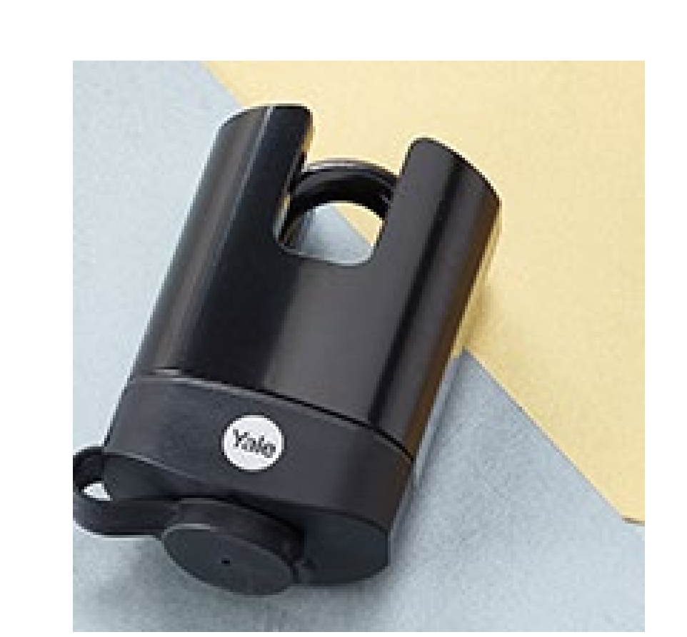
Exclusive Yale design

Even your garden tools can be kept safe and secure in your shed, with a hardened steel shackle to prevent cutting and double locking for added security, built with you in mind.