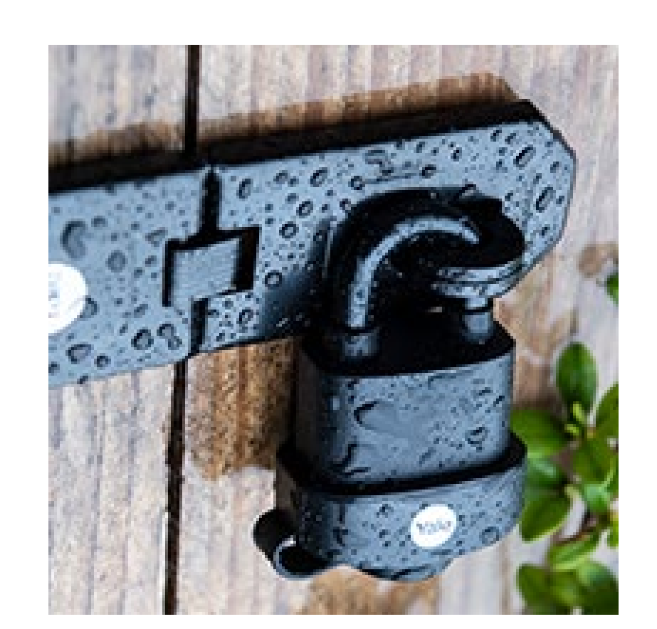
Designed for outdoor usage

With 180 years of manufacturing expertise, we are introducing our padlocks with an exclusive Yale design and tested to EN12320:2012 standard for added security and reassurance, built with you in mind.